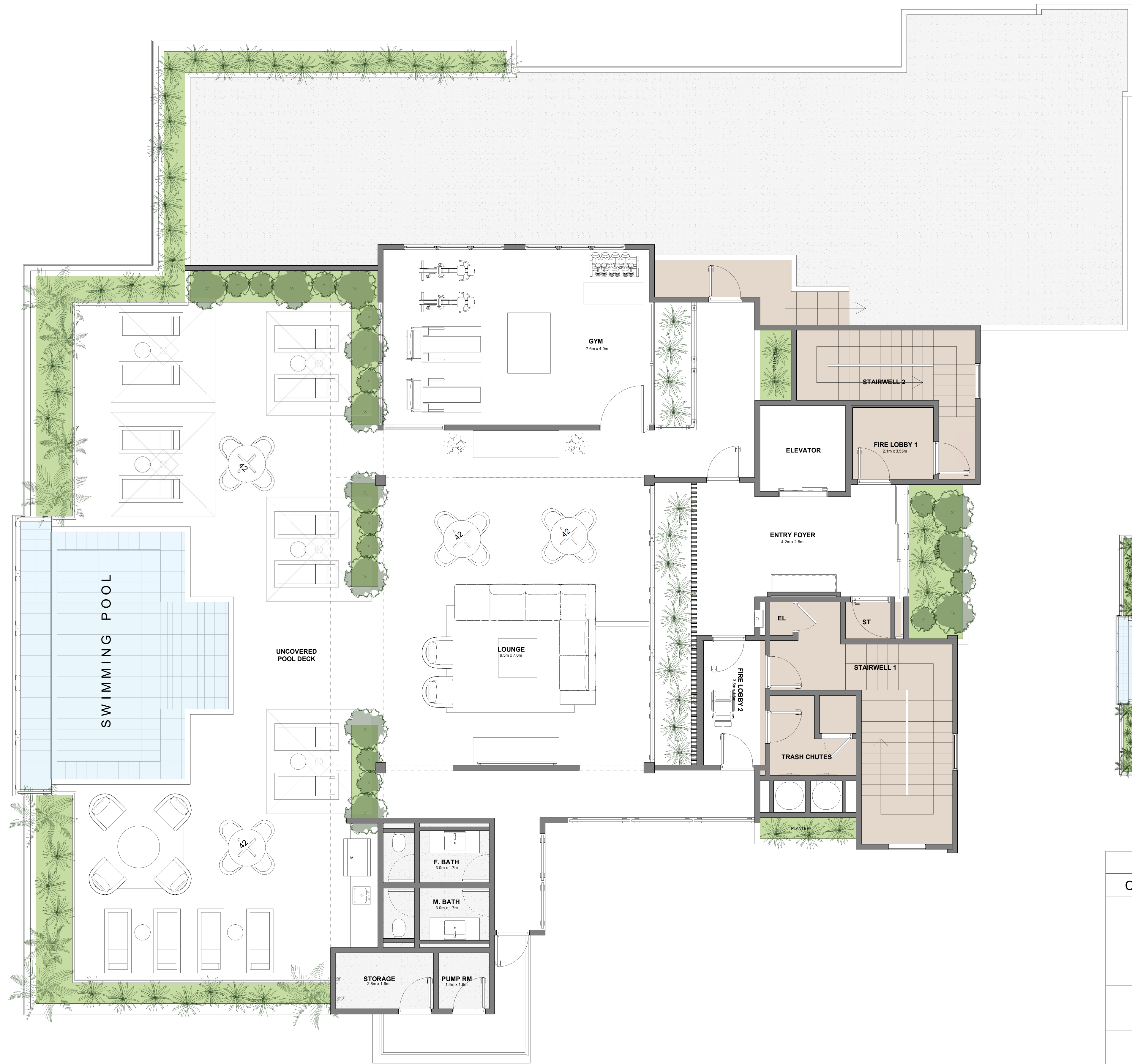
1 AMENITIES FLOOR PLAN 1 : 64